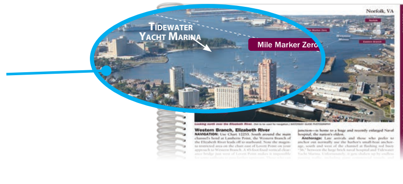
Quarter Page Ad